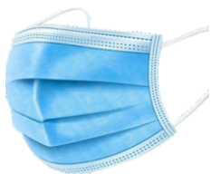
Disposable Medical Mask Disposable Surgical Mask