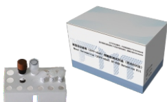
Antibody IgG/IgM COVID-19 Rapid Test Kit