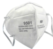
Disposable Medical Mask Medical Protective Mask KN95/KN90(N95/N90)