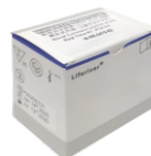
Real Time PCR Combo Kit